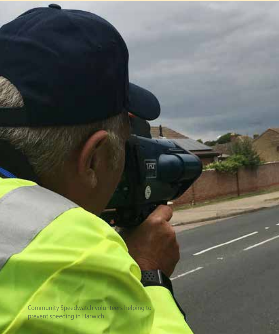
Community Speedwatch volunteers helping to prevent speeding in Harwich

“Our objective is to reduce harm on the roads and promote safer driving.”