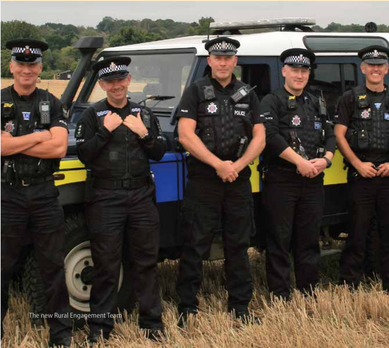
The new Rural Engagement Team

“ Our objective is to ensure that crime prevention is based in the community, that victims come first, and that you know what is happening in your neighbourhood.”