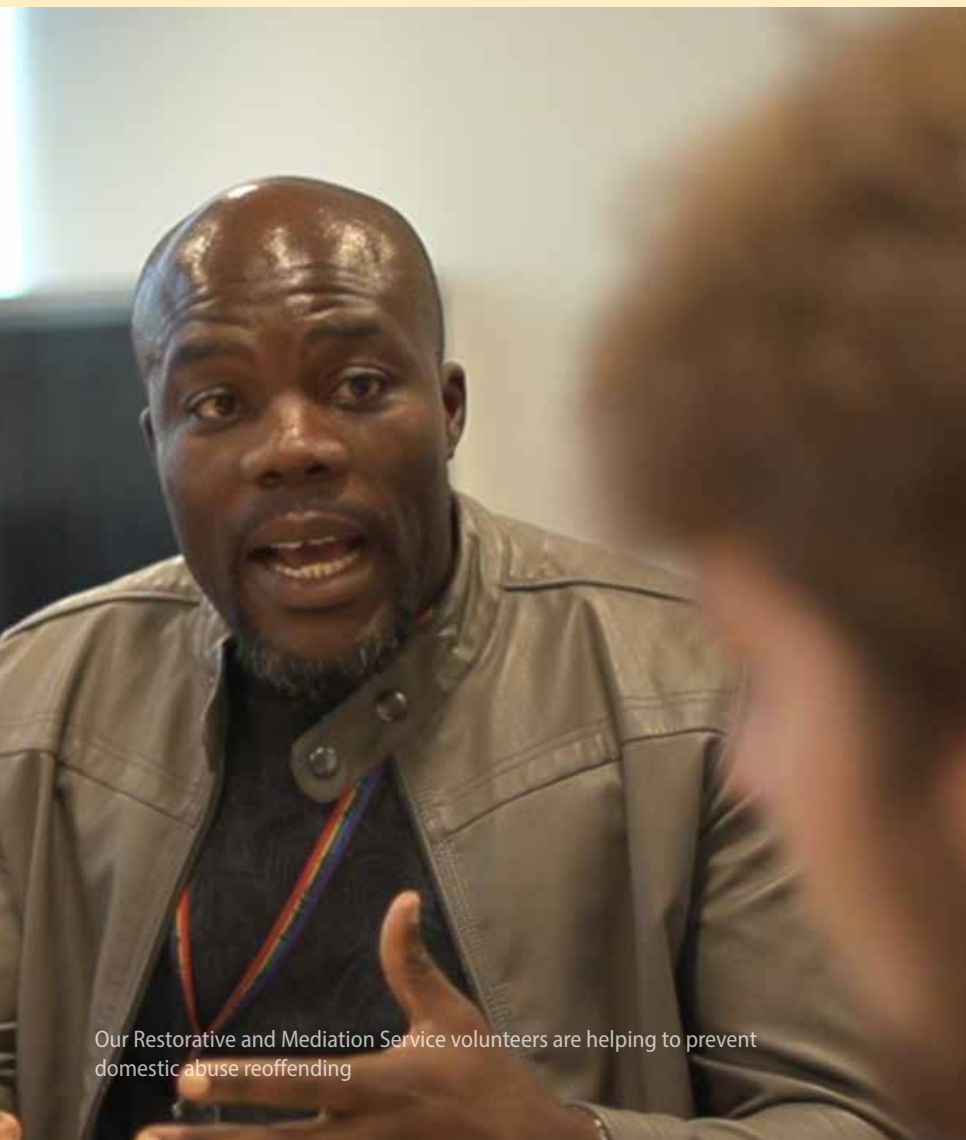
Our Restorative and Mediation Service volunteers are helping to prevent domestic abuse reoffending

“ Our objective is to help those who suffer in silence and reduce the impact on children and families.”